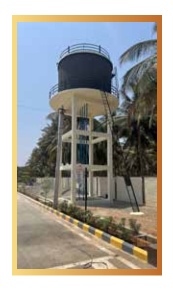
OVER HAED WATER TANK